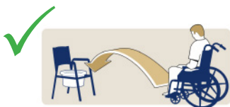
Chair to Commode/Toilet