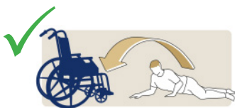
Floor to Bed/Chair