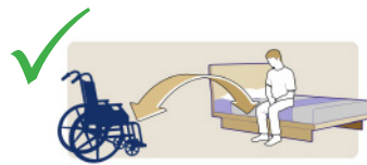
Bed to Chair/Chair to Bed