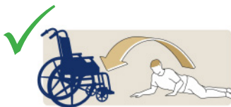
Floor to Bed/Chair (Head Support recommended)