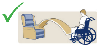
Chair to Chair