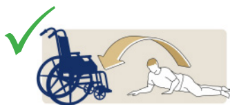
Floor to Bed/Chair (Head Support recommended)