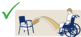
Chair to Commode/Toilet