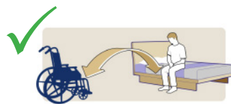
Bed to Chair/Chair to Bed