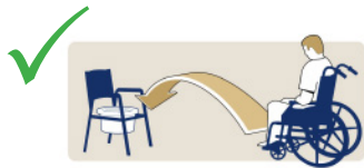
Chair to Commode/Toilet