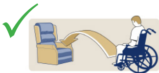
Chair to Chair