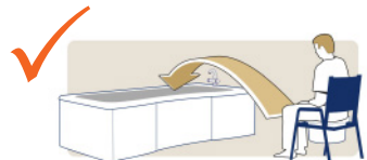
Transfer to Bath