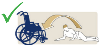
Floor to Bed/Chair (Head Support recommended)