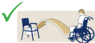
Chair to Commode/Toilet