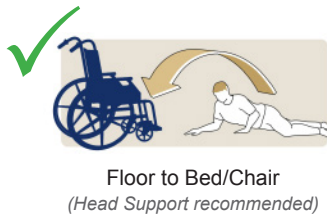
Floor to Bed/Chair (Head Support recommended)