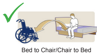
Bed to Chair/Chair to Bed