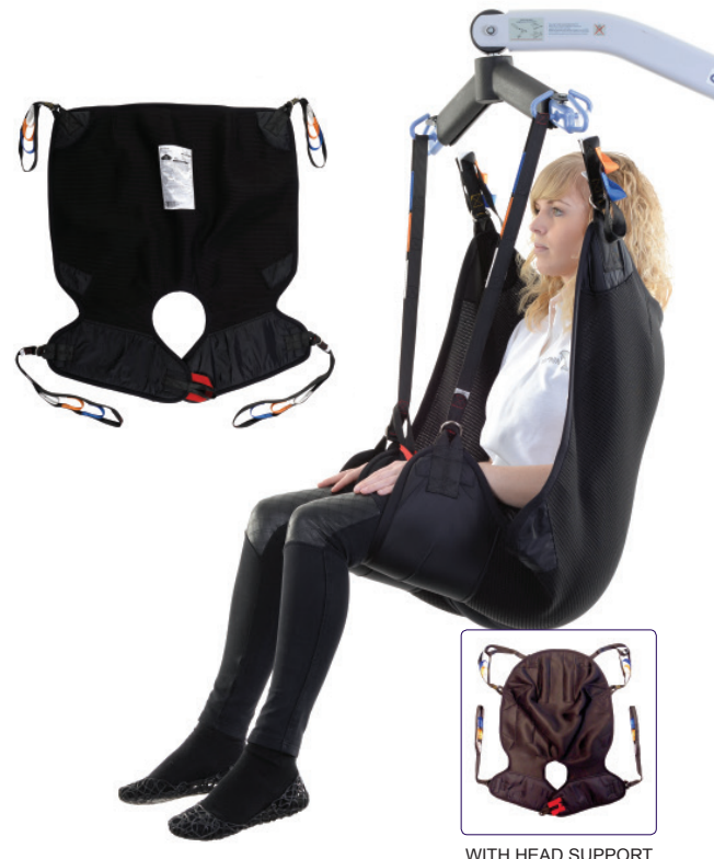
WITH HEAD SUPPORT