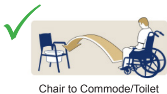
Chair to Commode/Toilet