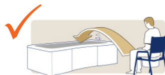
Transfer to Bath