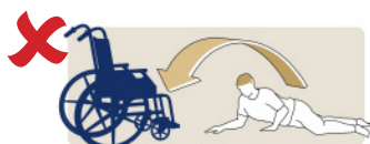
Floor to Bed/Chair