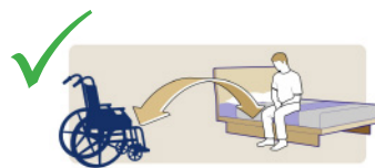
Bed to Chair/Chair to Bed (From seated position only)