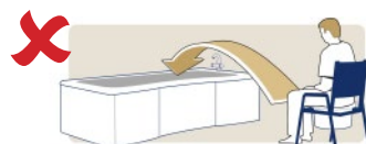
Transfer to Bath