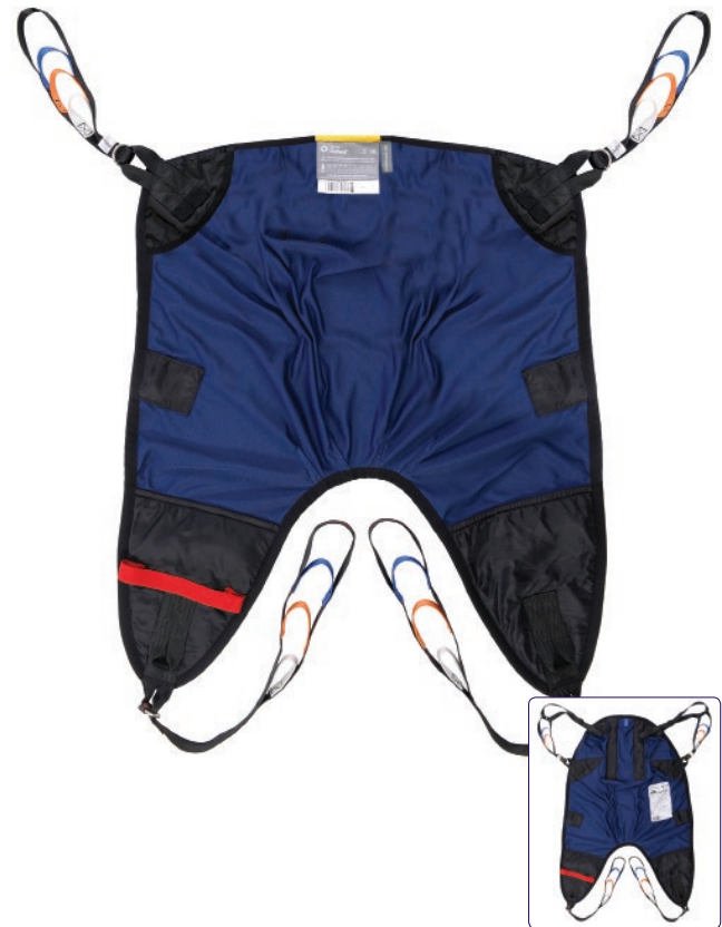
WITH HEAD SUPPORT