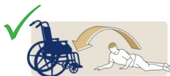
Floor to Bed/Chair (Head Support recommended)